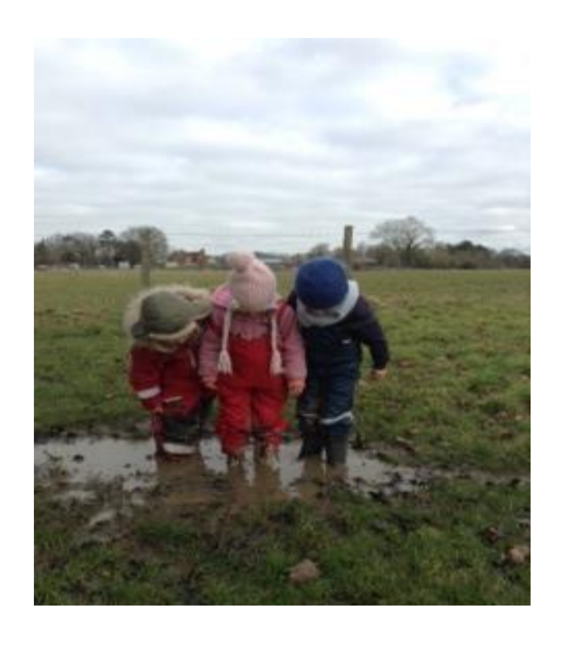
Welcome to our Nursery