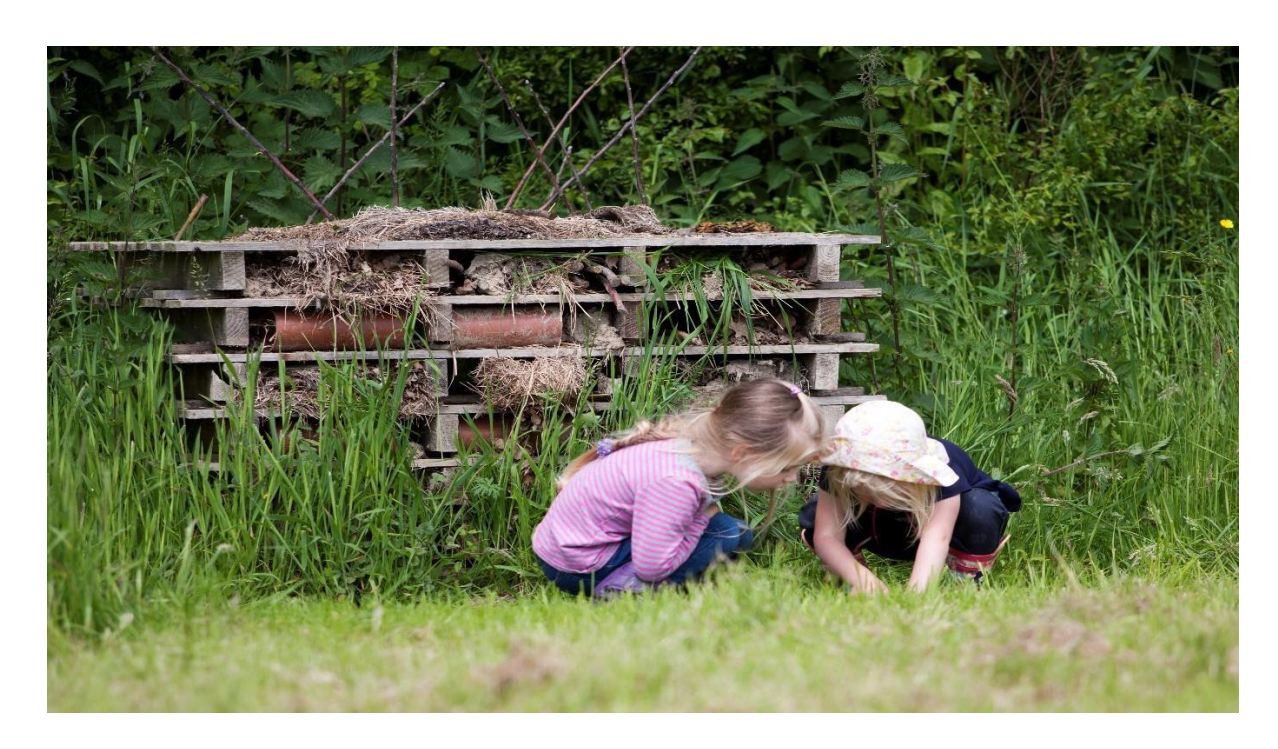
A Typical Forest School Day in the......Preschool (3-4 years)